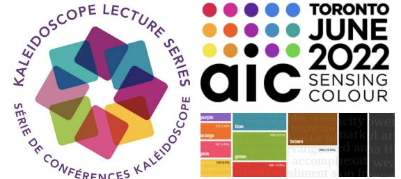
Logos for Kaleidoscope lecture series, by Haft2