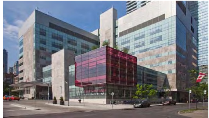
Colour design at the Women's College Hospital in Toronto.